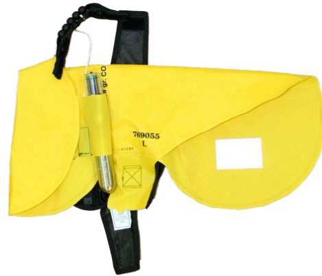
6. Fold oral inflator side outer edge towards center.