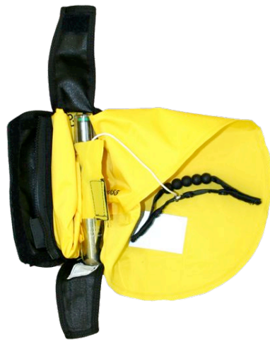
8. Fold remainder even with bottom and stow in pouch.