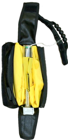
9. Repeat with other side.