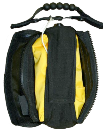
10. Pull bottom flap over bladder. Fold top down and mate hook and loop tape.