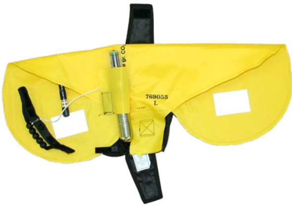
5. Fold bladder in half, behind inflator even with clear cap.