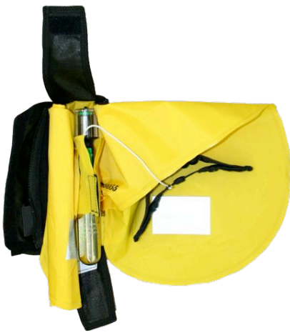
7. Tightly roll side of bladder and position next to inflator/bottle.