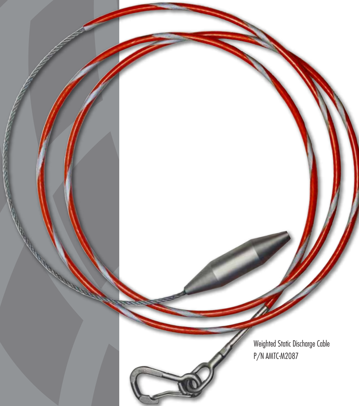
Weighted Static Discharge Cable P/N AMTC-M2087